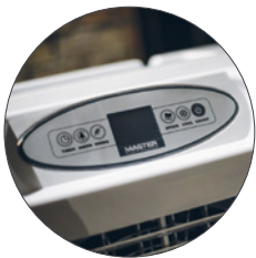
CCX 4.0 control panel